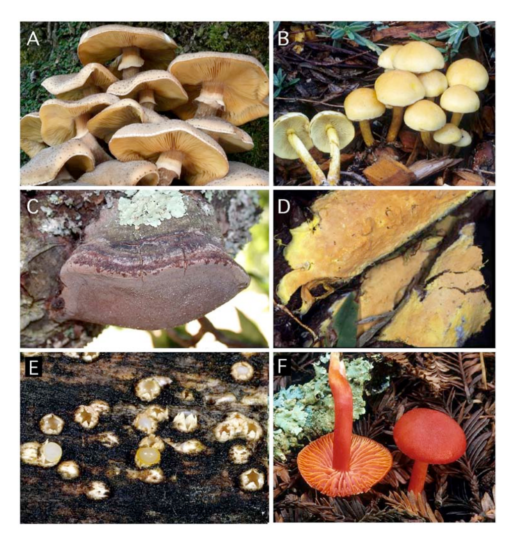
Fig. 3. Selected Tier 2 species (and close relatives), continued. A: Armillaria mellea . B: Hypholoma fasiculare . C: Phellinus igniarius , D: Phanerochaete flava . E: Sphaerobolus stellatus . F: Hygrocybe coccinea . A-C, D, E From <u>www.mykoweb.com</u> A, B, E by Fred Stevens, C by Darvin DeShazer, F by Mike Wood. D by David Hibbett.

• Panellus stypticus . This is a very widespread white rot member of the Agaricales. It is a member of the Mycenaceae, which includes many litter decayers. (It is also of interest because it is bioluminescent.)