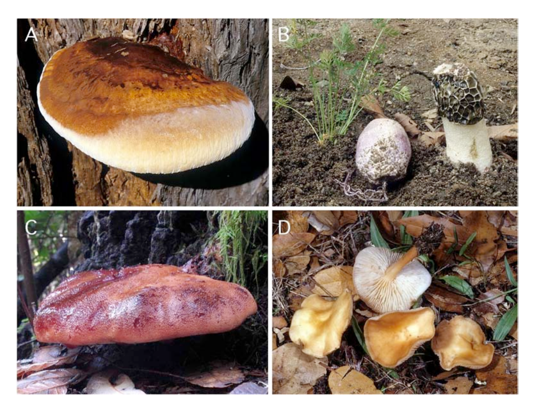
Fig. 2. Selected Tier 2 species (and close relatives). A: Ganoderma oregonense . B: Phallus hadriani . C: Fistulina hepatica , D; Gymnopus dryophilus .

Tier 2 : Sixteen white rot and one brown rot species, representing seven major clades of Agaricomycotina ( Figs. 2-3 ). Monokaryotic cultures of two species, Ganoderma sp., and Botryobasidium sp., are in the laboratory of DSH and are being prepared for DNA/RNA isolation. Monokaryons for eight other species have been located in the FPL, TENN, or MUCL (Belgium) culture collections. In several cases, the exact species identified as a target is not known to be available, but a closely related congener is available. The remaining seven species will need to be isolated from nature, or located in other culture collections. Two species, Sphaerobolus stellatus and Hygrocybe spp., may not be tractable (attempts to obtain monokaryons by fruiting Sphaerobolus dikaryons in culture have failed, and Hygrocybe is not known to be culturable) and may need to be replaced. Candidates for replacement have been identified ( Table 1 ). Notes on individual species follow.